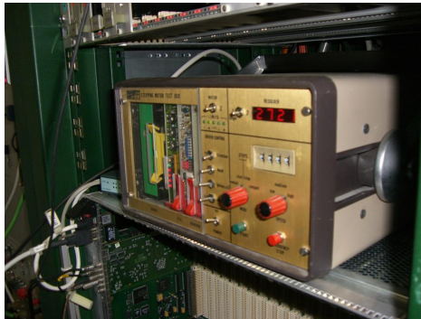
Figure 2: The stepper motor controll

The movement of the two movable wires is controlled from room R-022 in building R-022. Both wires are moved independently from the same device. The movement is calculated in magnetic steps: 200 fullsteps are 1 turn =1mm movement.